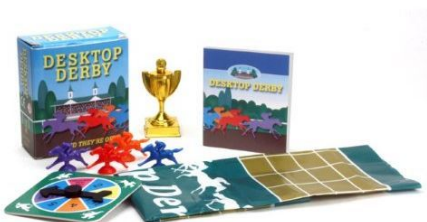
All this in a 3-inch box: This week’s second prize.

“American Pharaoh,” rather than “Pharoah,” last spring in the 21st running of The Style Invitational’s horse name “breeding” contest. This year, we checked the names of our stud roster more carefully (yes, Mooose really has three O’s) and so it’s off to the races with Year 22 of our most popular contest. At the bottom of this page is a list of 100 of the almost 400 racehorses nominated for this year’s Kentucky Derby, Preakness and Belmont; your job is to “breed” any two of them and name the “foal” to reflect both names , as in the examples above. Yes, every horse on the list is male; sorry, Kim Davis! As in the racing world, a name may not exceed 18 characters including spaces , but one or more of the characters may be punctuation marks or numerals. You may run words together, but the name still should be easy to read. Make sure to spell the original horse names correctly in your entry, or the E’s search button might skip over them. Please use the format in the examples. As always, you may send as many as 25 entries , preferably on a single e-mail.